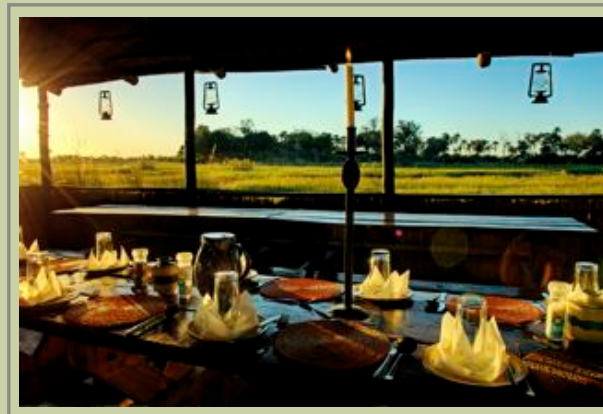
Main Complex - Dining area