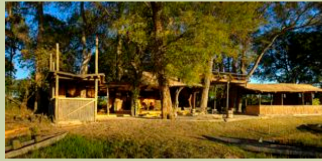
Main Complex - Exterior

It might also be possible to visit his village, meet the elders and perhaps his family. Subject to water levels, it is also possible to go camping.