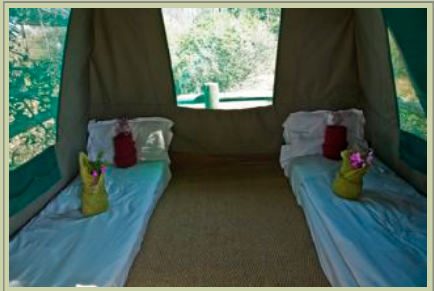
Tent - Interior

Camping equipment is provided, though it is suggested that you bring your own sleeping bag.