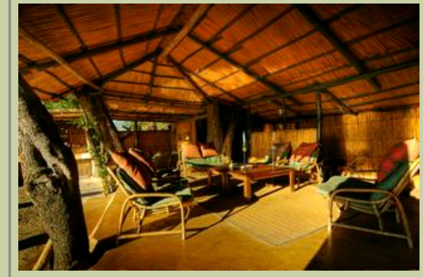
Main Complex - Interior