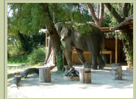
Main Complex - Visitor!