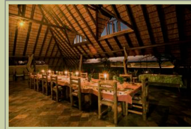
Main Complex - Interior