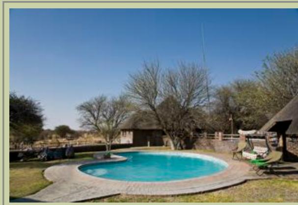
Main Complex - Pool area