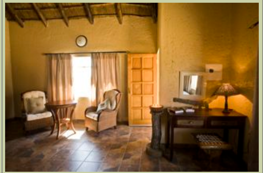
Suite - Lounge