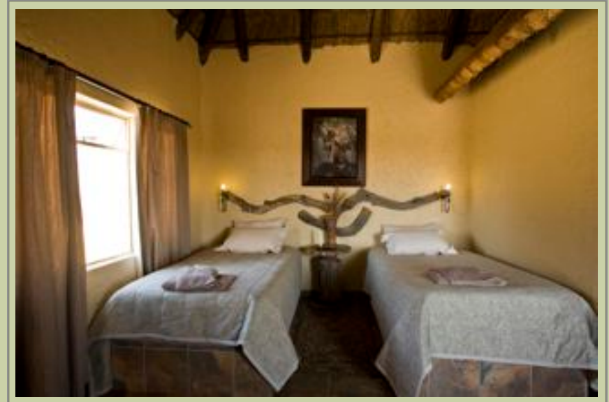
Suite - Bedroom

The San (Bushman) activities, and the seventh- generation family of owners, with a wealth of knowledge and history in the Kalahari.