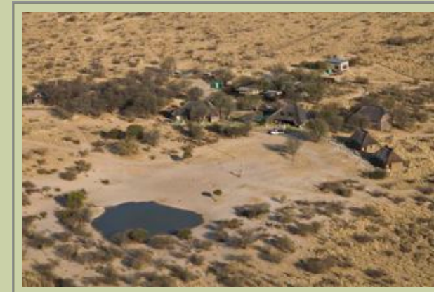
Arial View of Lodge