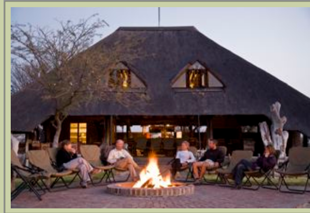
Main Complex - Exterior

Self-drive access is possible, although a 4 X 4 vehicle is required to reach the lodge. Alternatively guests traveling in a sedan vehicle can be collected by the lodge staff in Ghanzi (where secure parking is available) and transferred to the lodge.