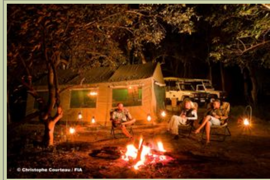
Main Complex - View