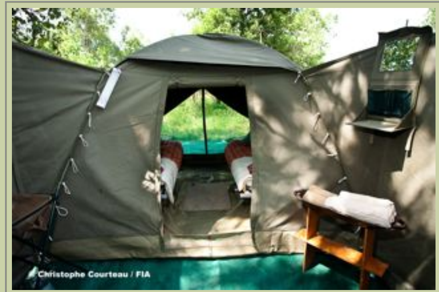
Tent - Bathroom