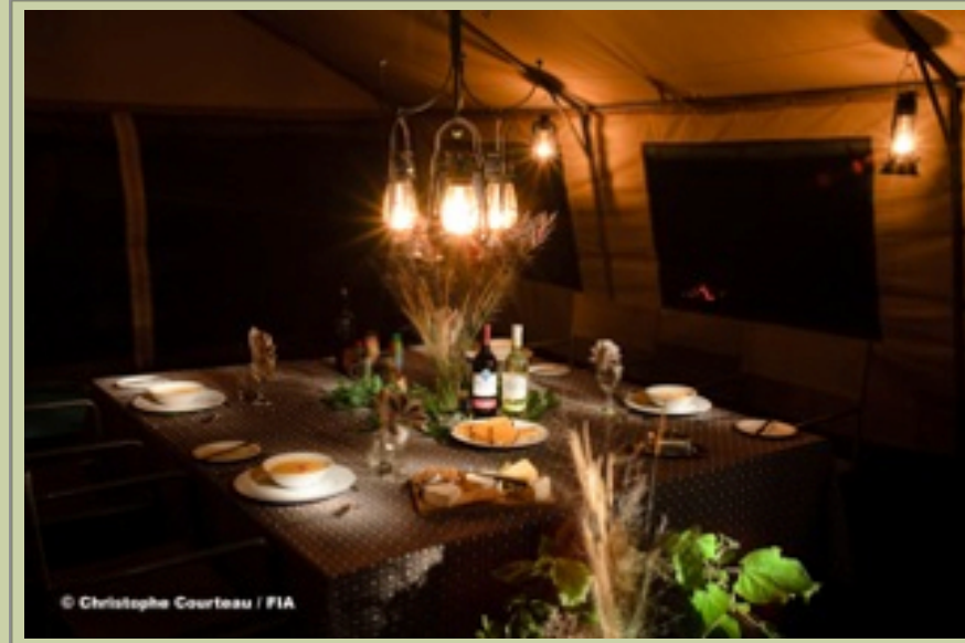
Main Complex - Interior