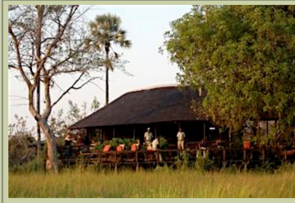
Main Complex - Exterior

The amazing design of the Chalets is such that you enjoy the luxuries of a 'top rate' hotel, but without affecting the environment; you will find you share your chalet with the trees, while taking full advantage of the views of the surrounding bush and flood-plains.