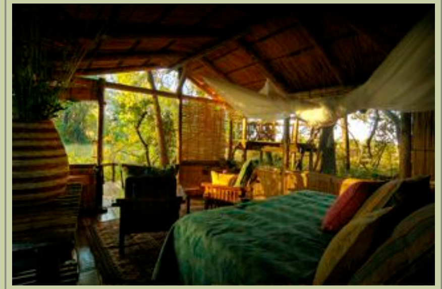
Suite - Bedroom

RATES: Rates are Fully Inclusive of local brand drinks and all activities.