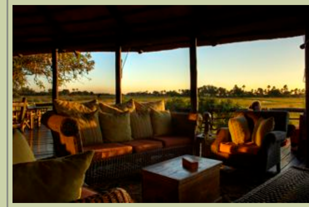
Main Complex - Interior