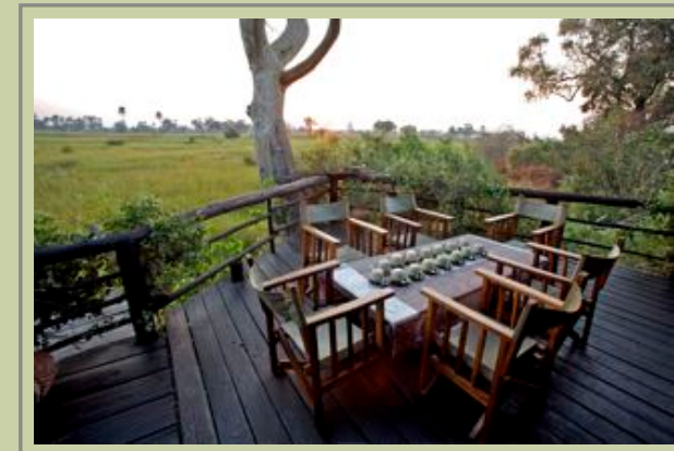
Main Complex - Tea Deck