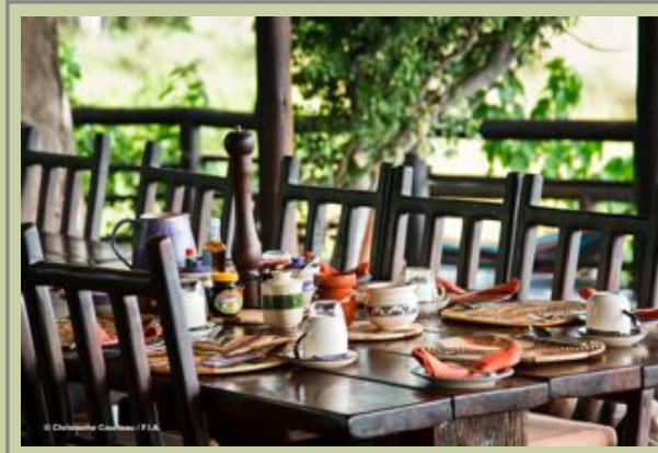
Main Complex - Dining area