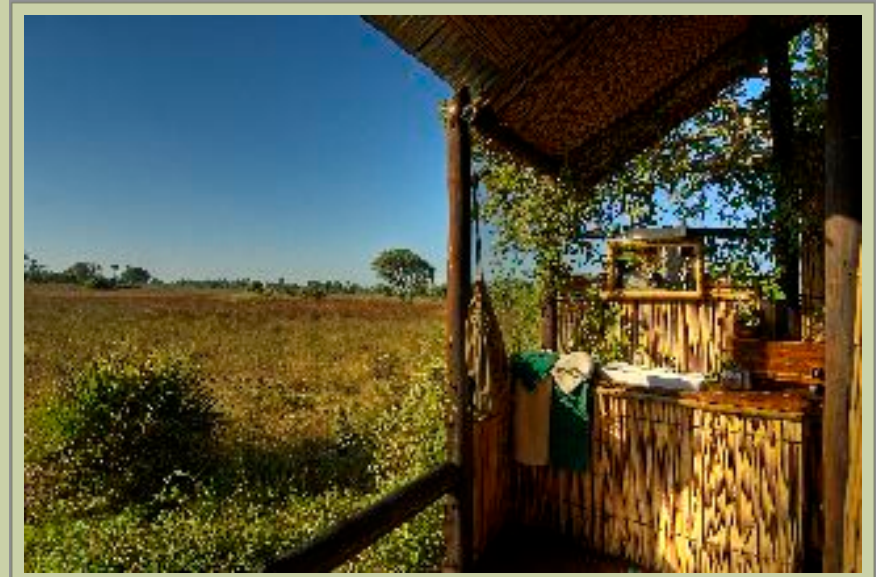
Suite - Bathroom