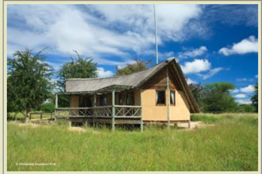
Suite - Exterior

are welcome. We have two family units. A private vehicle must be booked at an additional cost to ensure a more suitable and enjoyable experience for the whole family.