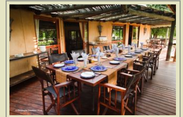
Main Complex - Outside Dinning