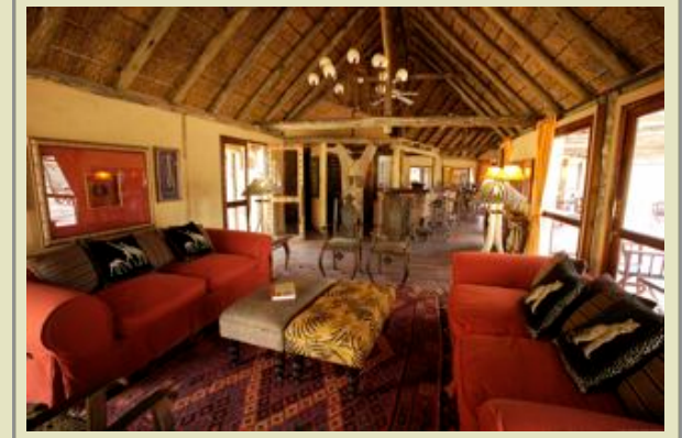
Main Complex - Interior