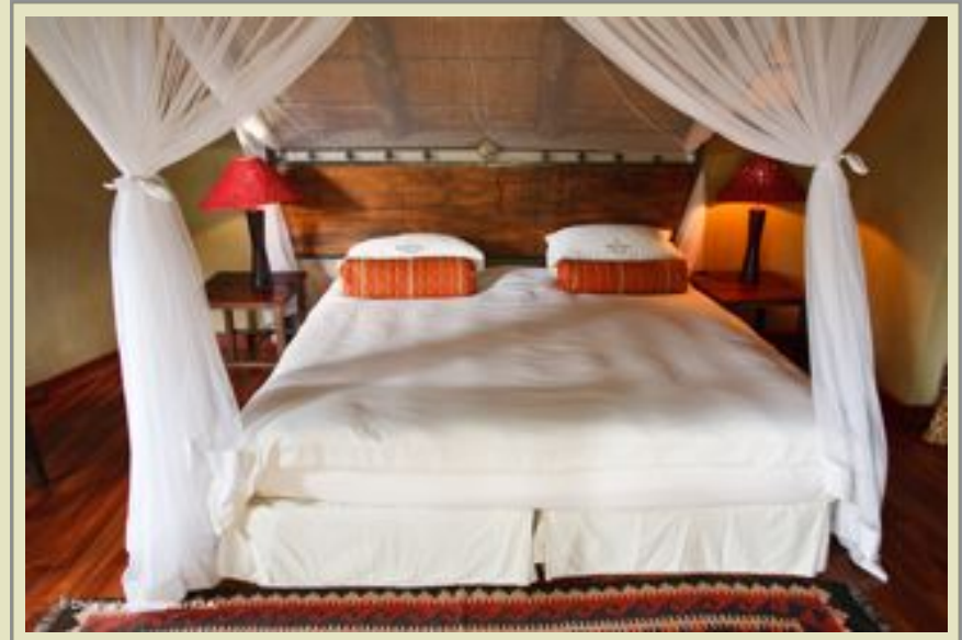
Suite - Interior