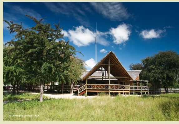
Main Complex - Exterior

Accommodation consists of eight private units, each consisting of a twin bedroom, a lounge and a Victorian style bathroom with an outside shower. Each unit has a deck where you can sit and gaze at the vastness of the Kalahari bush, stretching for miles in front of you.