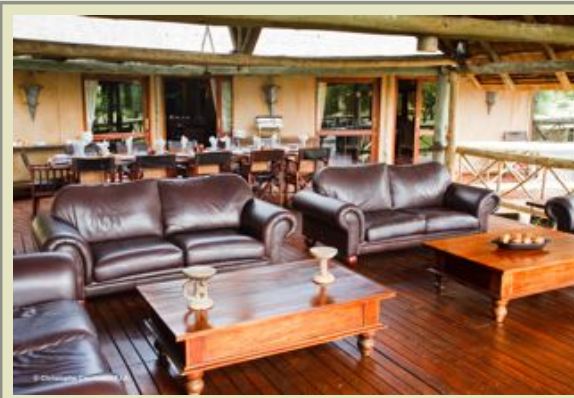
Main Complex -Outside lounge